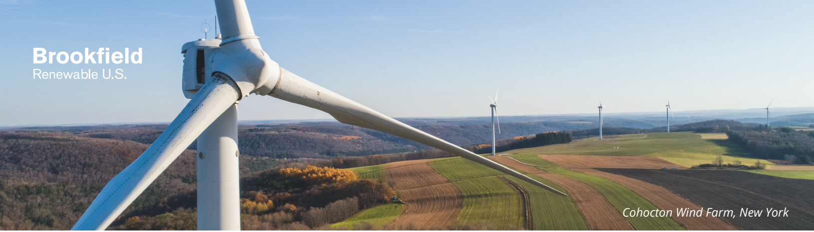
Cohocton Wind Farm, New York